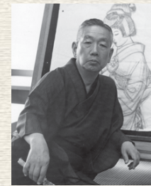
Ito Shinsui 1898-1972