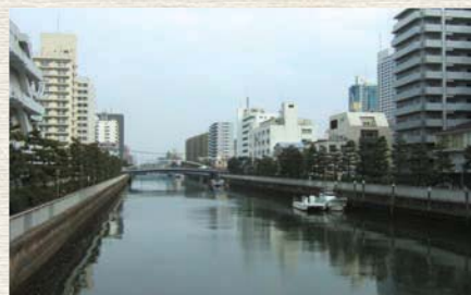
The Onagi-gawa River where the two boys swam

● Showa 2 (1927) age 29 He wins a special prize at the 8th Teiten Exhibition, now the Nitten Exhibition. Following this he can show his works at subsequent Teiten Exhibitions without having to present them to the exhibition judges.