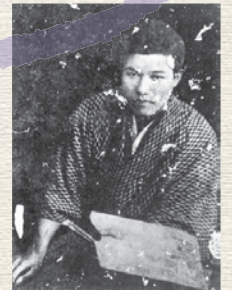
Sekine Shoji 1899-1919